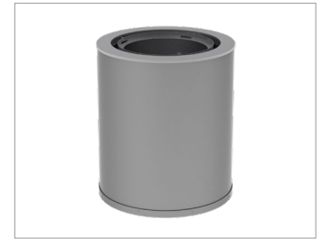
STANDARD - Large 50" w x 56 3/8" h Surface Mount