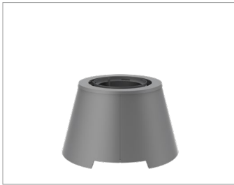
CONTRARIO - Mini 59 3/8" w x 36 1/8" h Freestanding

All planters feature built-in drainage openings and are designed to accommodate irrigation systems.