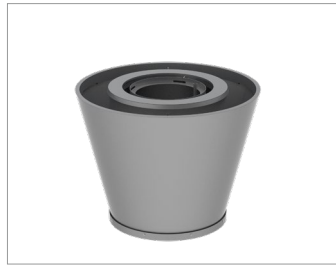
OLYMPUS - Mini 63 3/4" w x 48 3/8" h Surface Mount