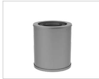
STANDARD - Mini 41 3/4" w x 46 1/8" h Surface Mount