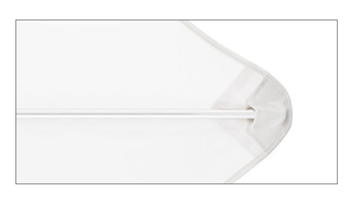
Double stitched, reinforced pocket construction