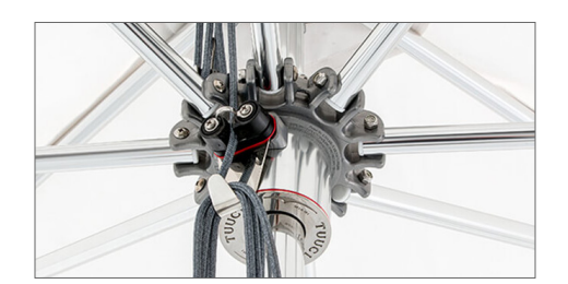
Polished aluminum hub system