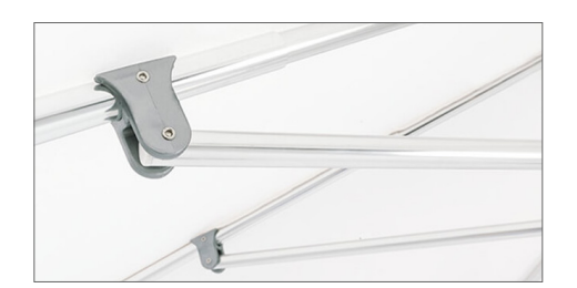
Reinforced tubing at joints